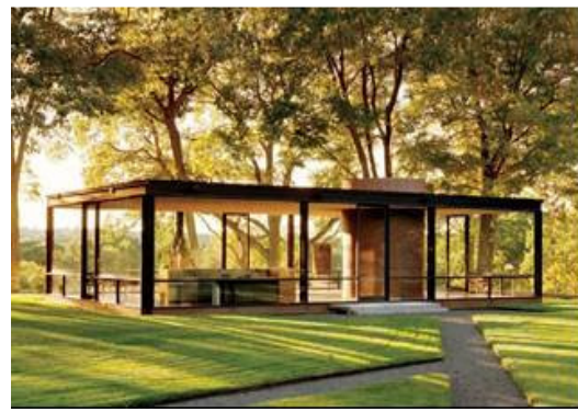
The Glass House 22

43. This option allows public access to the Dining Room for national education purposes, while not revealing other details about the late Mr and Mrs Lee's way of life, as the rest of the Property would have been demolished.