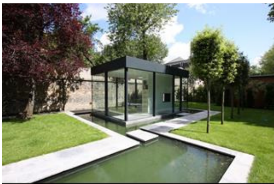
The Garden Room 21